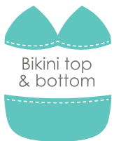
Bikini top & bottom